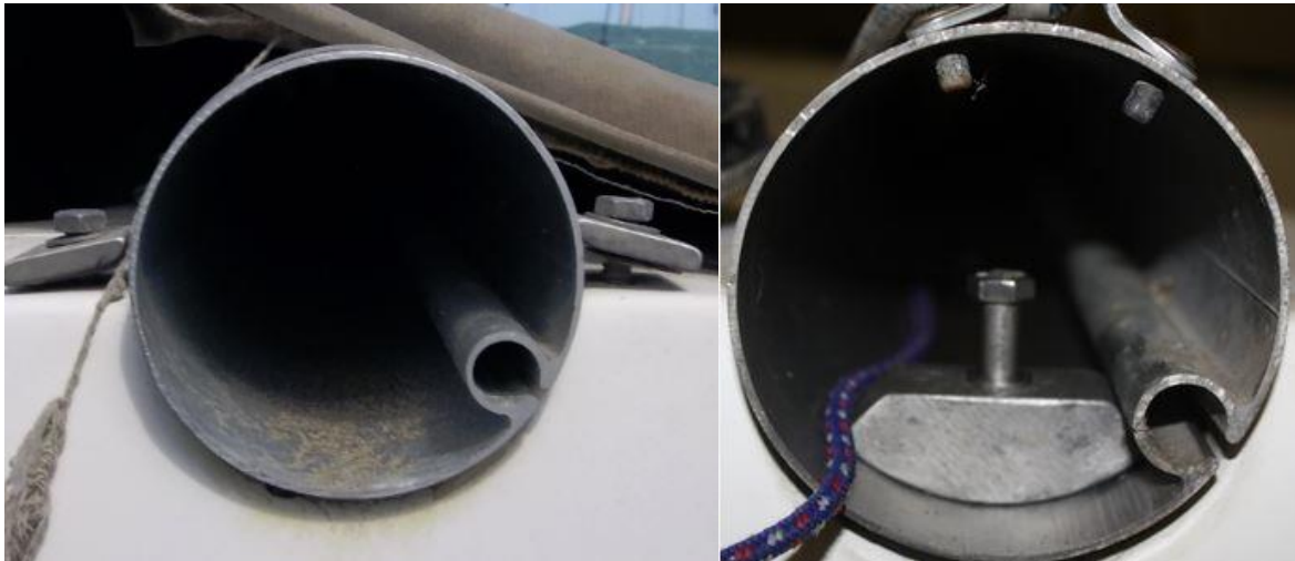
Photos: No Internal Beam Casting or bolt (Left). With Internal Beam Casting and Bolt (Right).